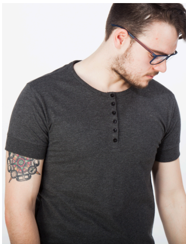
Antlers & Crown Henley Grey