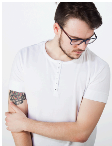
Antlers and Crown Henley White